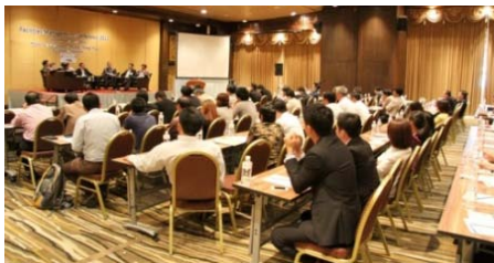
ilities Management Conference 2012 September 20 th , 2012 Phoenix 1-2 Impact Muang Thong Thani Bangkok, Thailand