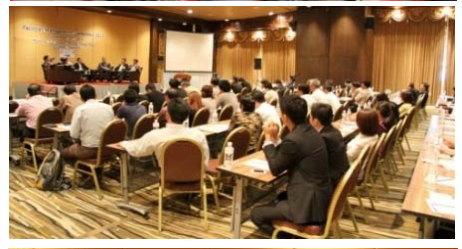
Facilities Management Conference 2012 September 20 th , 2012 Phoenix 1-2 Impact Muang Thong Thani Bangkok, Thailand